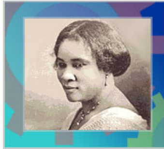
Madam C. J. Walker