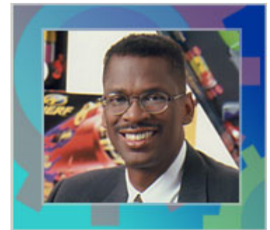
Lonnie G. Johnson

Madam C. J. Walker (1867–1919) invented a hair-growing lotion. Fast Fact: Walker grew up poor. But she became the first female African- American millionaire.